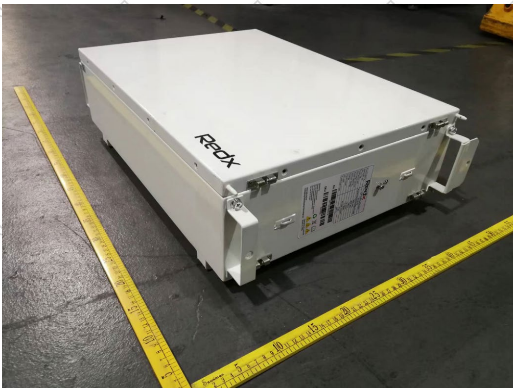
Figure 2 Overall view II of battery (外观图II)