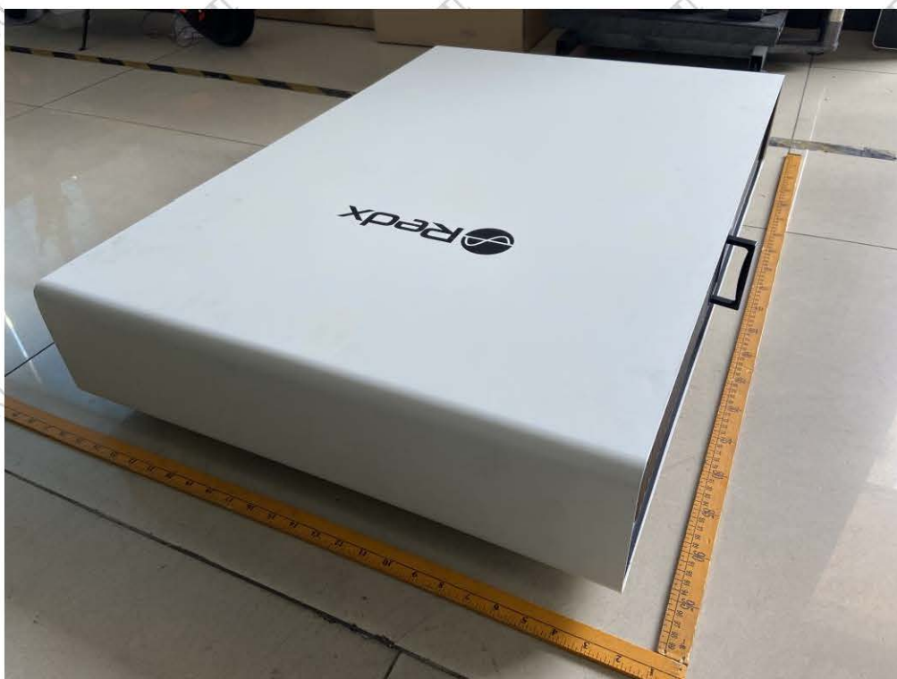
Figure 2 Overall view II of battery (外观图II)