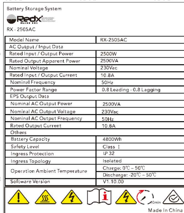
Figure 4 Battery Label (电池标签)