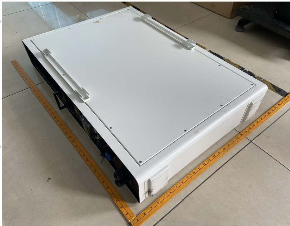
Figure 1 Overall view I of battery (外观图I)